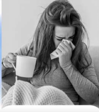
MEMORY / IMMUNE DECLINE