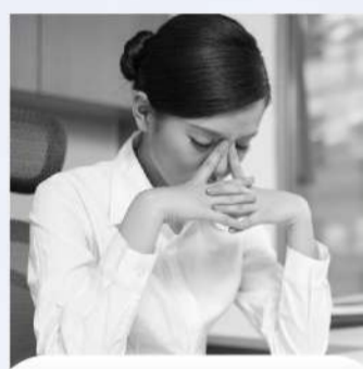
WORK STRESS FATIGUE