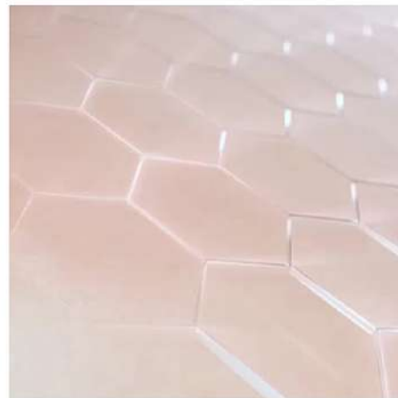
Healthy Skin Barrier