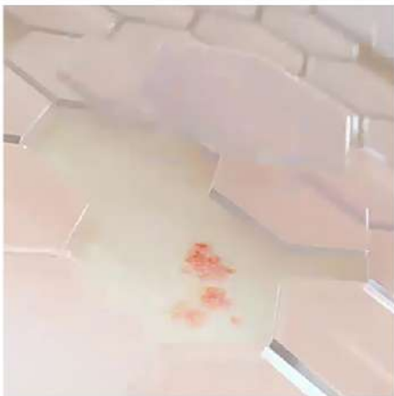
Unhealthy Skin Barrier

when integrity of skin barrier is altered beyond its self-repair mechanism (damage>repair) causing continuous increase water loss and invasion of antigen